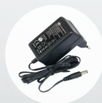
24V 0.8A Adapter